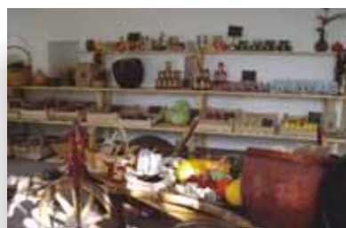
«Amour Koriz» the first organic shop in Armenia

In autumn 2006, through support from Shen NGO and financial assistance from EPER and SDC, the Organic Food and Consumers Association opened the first organic shop in Armenia - "Amour Koriz". The shop sells fresh and dried fruits and vegetables, herbs and nuts.