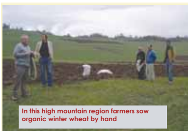
In this high mountain region farmers sow organic winter wheat by hand

the U.S. colleagues. However the ACDI/VOCA team sees the FFf program as being of benefit not only to the hosts but also to the volunteers.