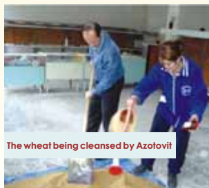
The wheat being cleansed by Azolovit

So far the members of the farmer group in Gandzakhar have been basically involved in vegetable production (green beans, cucumber, tomato, garlic, pepper, basil, and parsley) as well as in collection of wild berries. The products were mainly sold in the regional center; however the farmers find it possible to market part of the product in Yerevan where there is specialized store for organic products.