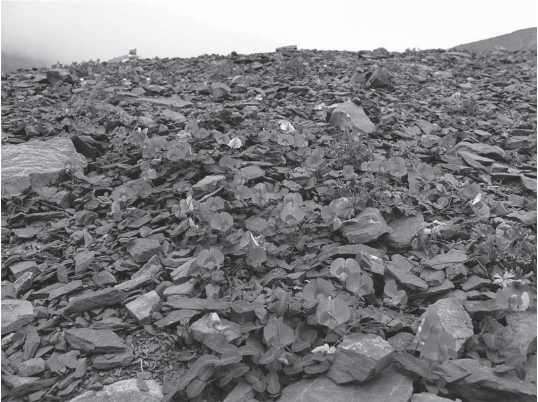
Figure 3. A vavilovia population from Dagestan, Russia Slika 3. Populacija vavilovije u Dagestanu, Rusija

vavilovia are Central and Eastern Caucasus (Grossheim 1952, Galushko 1980), its geographical area of distribution is rather disjunctive (Fig. 2). In the Russian Federation, isolated vavilovia populations may be found in Cabardino-Balkaria, Dagestan (Fig. 3), Karachevo-Cherkessia and Northern Ossetia (Dzuybenko & Dzuybenko 2009). Vavilovia is present in the wild floras of other ex-USSR countries, such as Armenia (Fedorov 1952), Azerbaijan (Carjagin 1954, Gadzhiev & Musaeu 1994) and Georgia (Kolakovskiy 1958, Arabuli 1981), as well as in the neighbouring regions in Iran (Rechinger 1979), Iraq (Townsend & Guest 1974), Lebanon and Syria (Maxted & Ambrose 2000) and Turkey (Davies 1970). In many of these countries vavilovia is considered an endangered species and is officially protected (Popov 1988, Gabrielyan 1990).