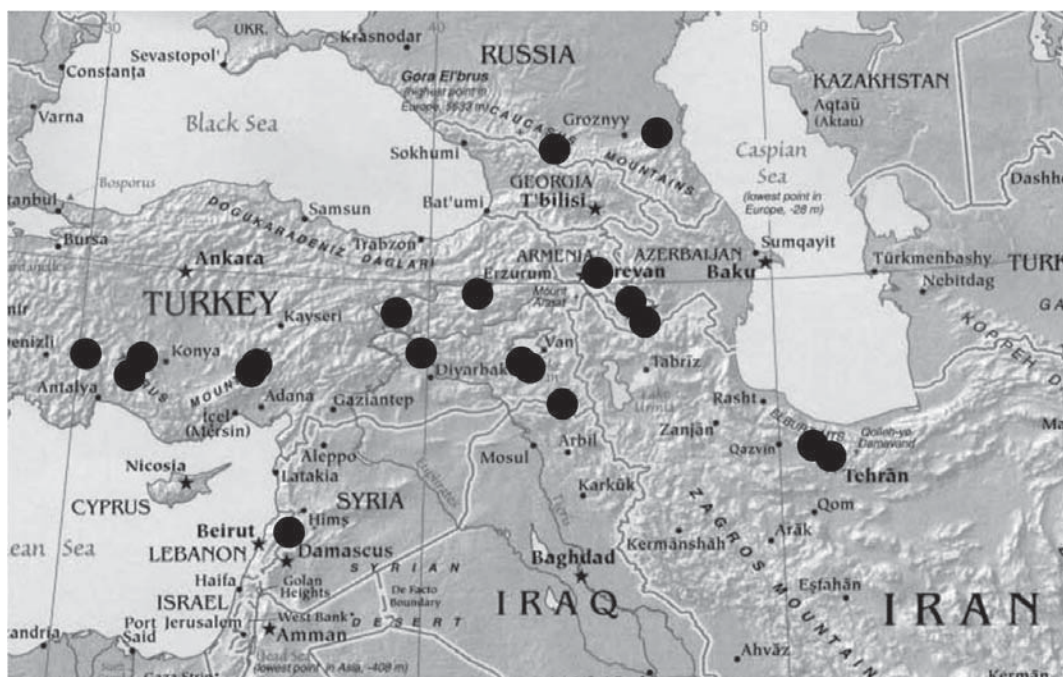
Figure 2. Geographical distribution of vavilovia Slika 2. Geografska rasprostranjenost vavilovije

Vavilovia prefers mountain areas with altitudes from 1,500 m up to 3,500 m. It grows on shale or rocky ground, with loose limestone scree as a typical example. Although the main homeland of