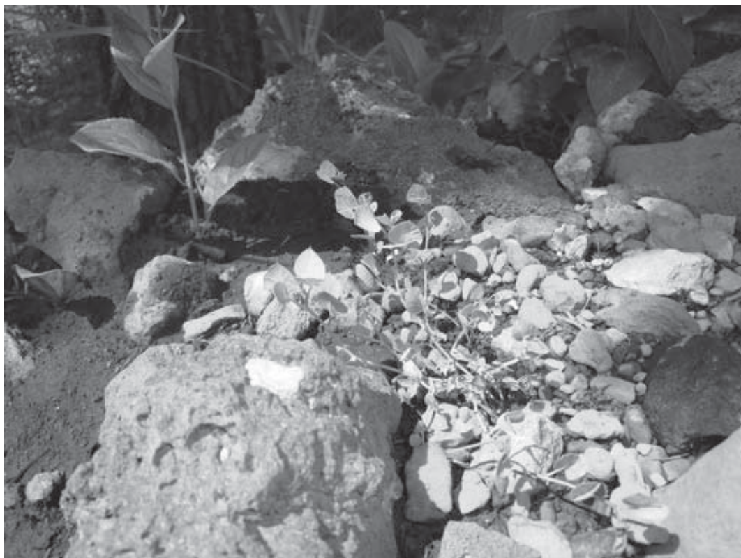
Figure 4. An example of the vavilovia ex situ conservation, Yerevan Botanic Garden, Armenia Slika 4. Primer ex situ konzervacije vavilovije, Botanička bašta, Jerevan, Jermenija

Official Seed Testing Station in Edinburgh and at Southampton University, UK (Cooper & Cadger 1990) but these did not provide the production of new seeds or the plant multiplication. During 1974-1981, sound results were obtained in the N. I. Vavilov Institute of Plant Industry by combining growing the plants in the field and in climatic chambers, with some of the plants surviving for some years, blooming and even producing fruits with seeds (Golubev 1990).